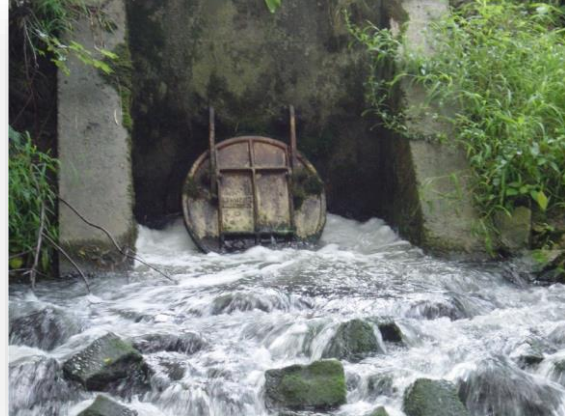
Operating intermittent sewage discharges

The presence of discharges is not always obvious – not all are identified with buoys or 'isolated danger' marker posts.