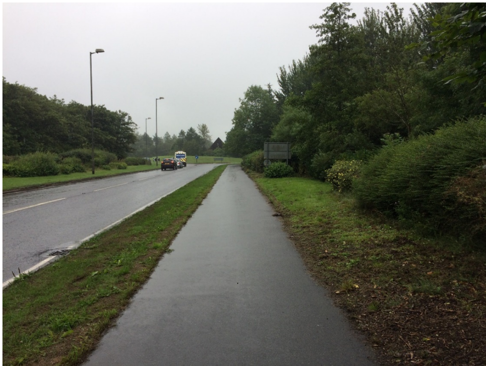
Figure 6. A595 (south) looking towards the Lillyhall roundabout (the MRF is to the right of the path)