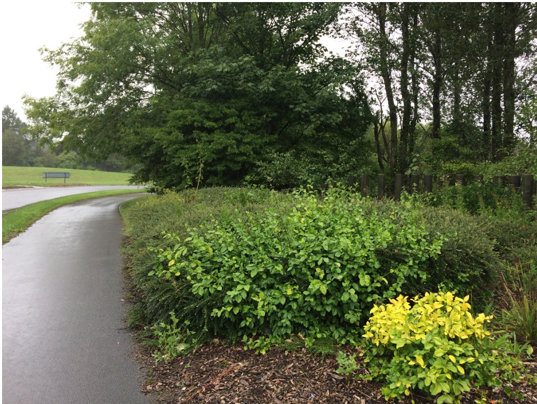
Figure 4. A595 (south) looking towards the Lillyhall roundabout (the MRF is to the right of the trees)