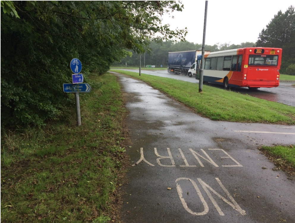
Figure 5. Braithwaite Road looking towards the Lillyhall roundabout (the MRF is to the left of the sign)