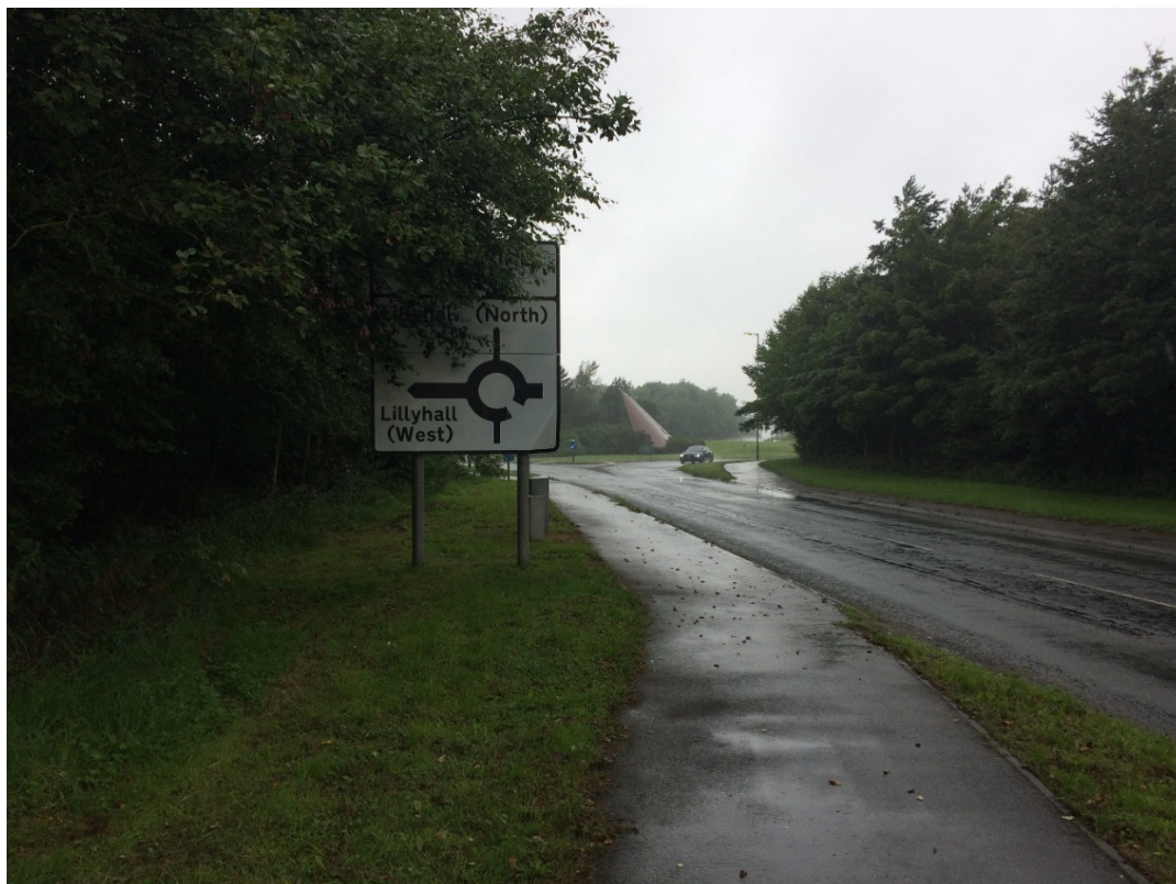
Figure 2. Braithwaite Road looking towards the Lillyhall roundabout (the MRF is to the left of the sign)

Information obtained from MRF representatives confirmed that the activities near the site were driving, cycling, jogging and walking. The people walking in the area were primarily employees from the businesses on the industrial estate walking at lunchtime. Traffic was primarily free flowing at the roundabout and might only back up if there is an accident on the A595.