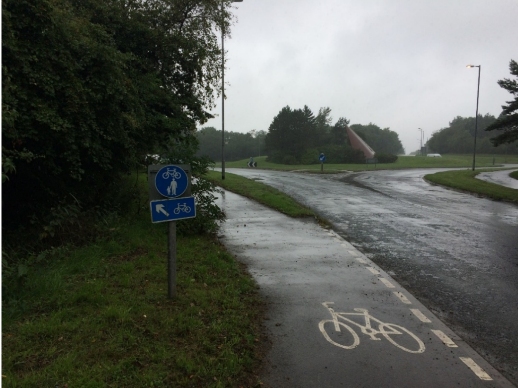
Figure 3. Braithwaite Road and cycle path looking towards the Lillyhall roundabout (the MRF is to the left of the sign)