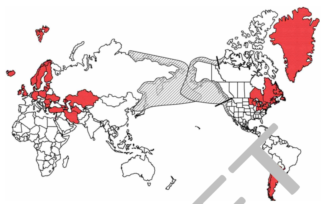
Figure 1. Map (from Crawford & Muir 2007) illustrating the nation go (blc., diagonal), where spawning fish have been reported throughout, and primary distribution (black of the salmon Oncorhynchus gorbuscha , with introduced range (red) by country or their internal term (i.e. state or province).