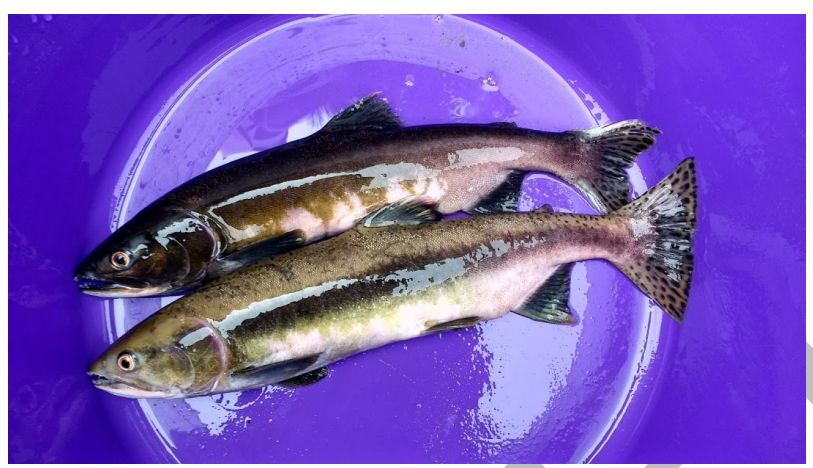
Figure 6.1. Spent female O. gorbuscha kelts captured in the River Ness on 16 August 2017.

Ness in September 2017 (C. Conroy, pers. comm.) includes the recovery from redds of 'eyed ova' (Figure 6.3) and empty egg shells indicative of spawning activity and successful fertilisation. These redds are believed to have been were created on 8 August at water temperatures on or around 15°C, with limited hatching observed 28 days later (C. Conroy, pers. comm.).